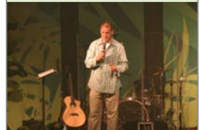
Great for speaking engagements