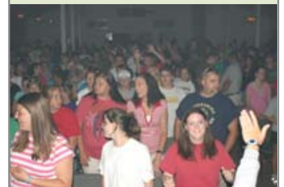
Worship service during camp